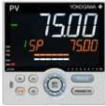
UT75A Advanced Temperature Controller