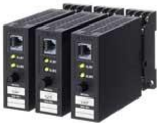
Compact Plug-in Type JUXTA VJ Series